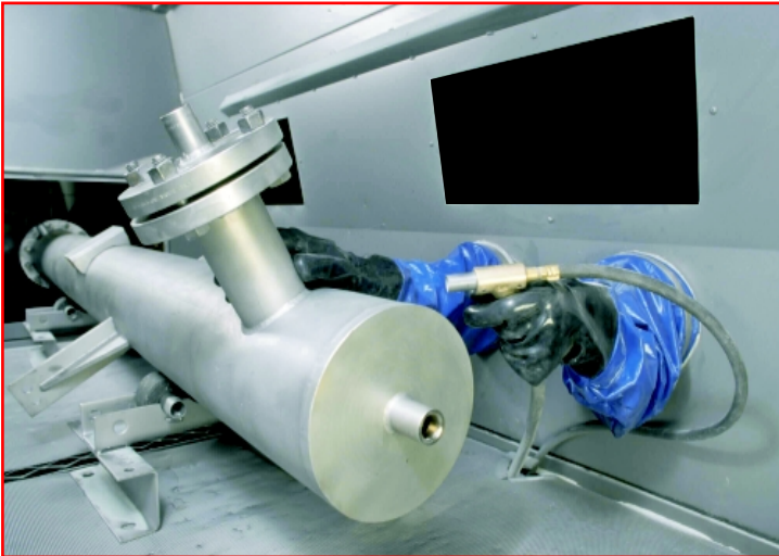
INTERNAL VIEW OF BLASTING CABINET

ACOUSTIC CHAMBER, DUST COLLECTOR, SPRAY BOOTH, ABRASIVE BLASTING MACHINES